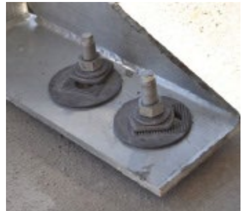
Lower Connection: OrbiPlate™ and Ramset™ ChemSet™ 502